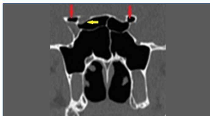
[Table/Fig-8]: Coronal CT section showing pneumatization of bilateral anterior clinoid processes (red arrows) and bony dehiscence of the optic canal on right side (yellow arrow).